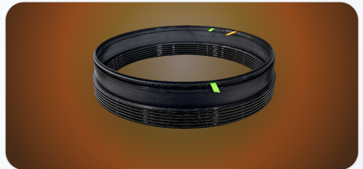
Oil and gas seal geometry example for material and process review.